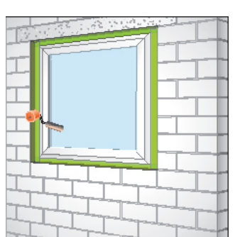
Fig 3: Consolidate the butyl bond using a roller