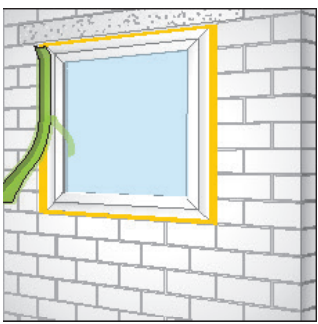
Fig 1: Bond membrane to face of frame

Safety data sheet must be read and understood before use.